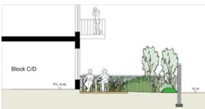
Section BB 1:100 @ A3