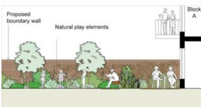
Section AA 1:100 @ A3