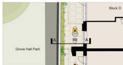
Plan Scale 1:100