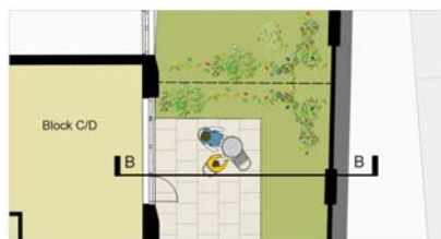
Plan Scale 1:100