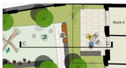
Plan Scale 1:100