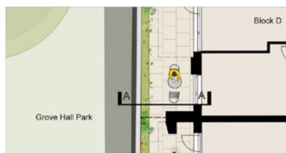
Plan Scale 1:100