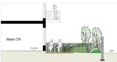
Section BB 1:100 @ A3