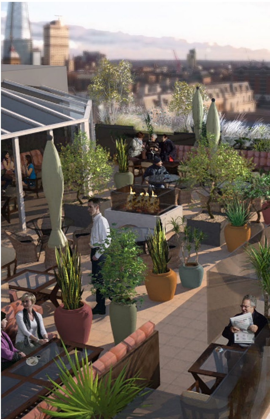
Mercer Roof Terrace