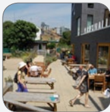
Vauxhall City Farm, Lambeth

Below is a selection of additional projects of note which do not appear elsewhere in this document.