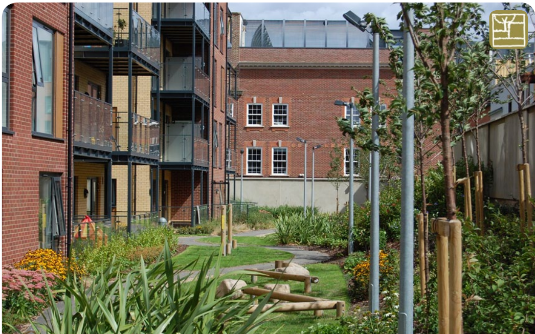
Silver Works, Colindale, Brent Linear park with amenity space including planting and play to rear of residential development