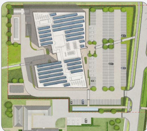
Building 800, Chesterford Research Park, Little Chesterford, Essex

We are experienced in defining strategic wayfinding strategies by using a clear hierarchy of materials. This ensures the landscape is legible and a suitable sense of arrival can be provided.