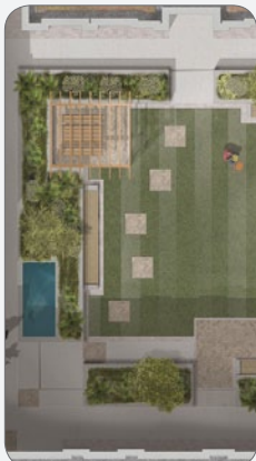
Young Street, Kensington & Chelsea

We are experienced in preparing packages of landscape related information for submitting to the Building Safety Regulator for higher-risk buildings, as required by the Building Safety Act.