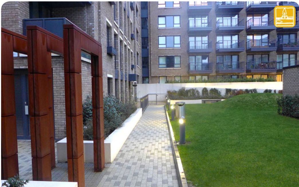
Marine Wharf East, Bermondsey, Southwark Communal roof courtyard garden with seating, planting and play features.