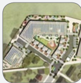
London Road, Wembley, Brent