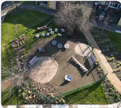
Partridge Way, Wood Green, Haringey

Play and spatial arrangement are carefully considered when designing school environments. Circulation, active and passive zones are all key to creating successful school landscapes.