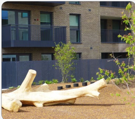
Chocolate Factory (Block E2), Haringey