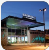
East Village Marketing Suite, Stratford, Newham