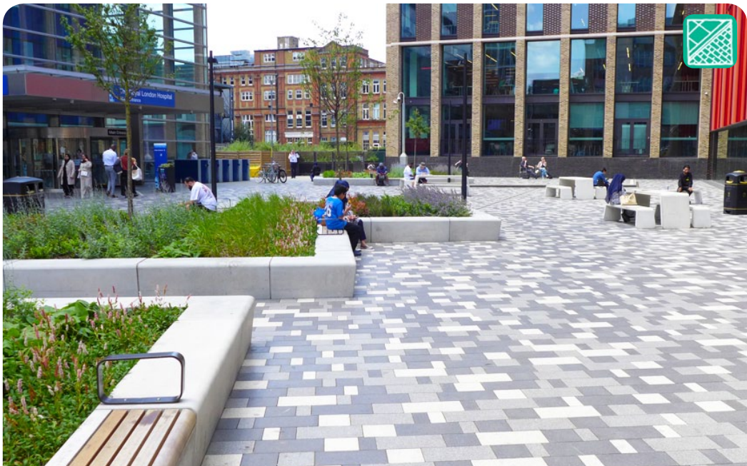
London Square, Tower Hamlets Detailed design of new public square located between Royal London Hospital and Tower Hamlets Town Hall