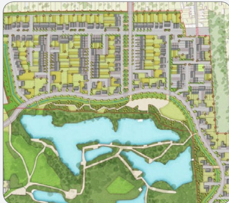
Star Lane Ph 2, Great Wakering, Essex