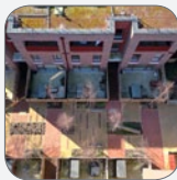
Leyton Green Road, Waltham Forest