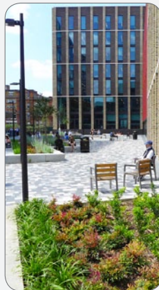
London Square, Tower Hamlets