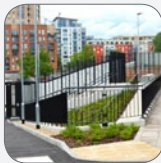
RHDA, Colindale, Brent