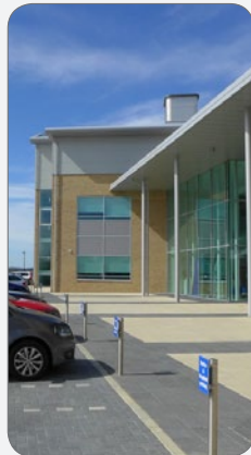
Robinson Building, Little Chesterford