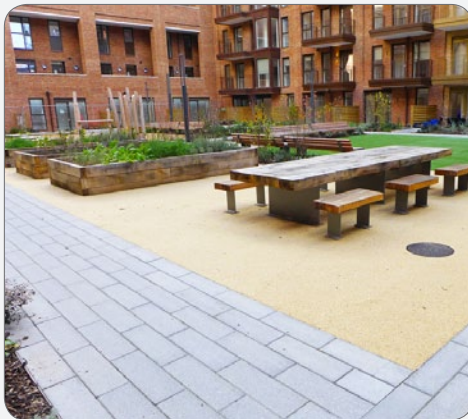
Aylesbury S05 & S06, Albany Road, Southwark

We are well versed in developing planting plans to ensure the mandatory 10 percent biodiversity net gain (BNG) is achieved.