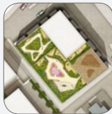
Edgware Road, Colindale, Brent