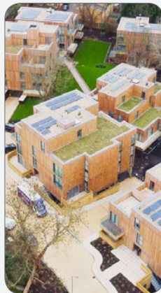
Tyson Road, Forest Hill, Lewisham