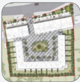
Leatherhead Road, Kingston Upon Thames