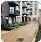
Harper Road, Borough, Southwark