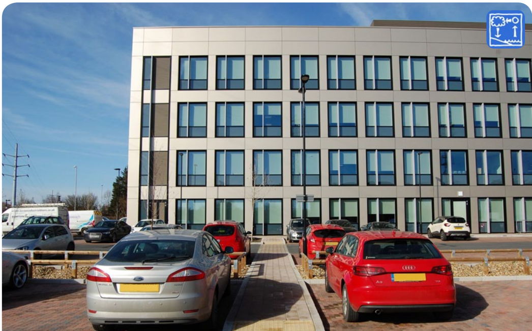
Maurice Wilkes Building, Cambridge Car parking bays with permeable paving which discharge surface water run off into the adjacent planted swale feature.