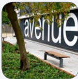
Avenue School, Manor Park, Newham