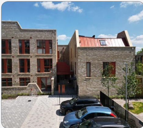
Gillan Court, Grove Park, Lewisham

We fully understand the functional requirements of residential communities. We design landscape space so the requirements of various service and delivery vehicles are integrated elegantly into our final landscape design.