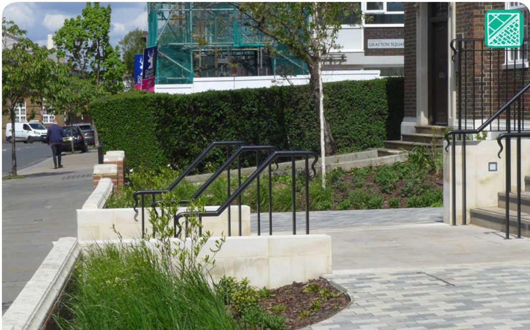
Maritime House, Clapham A functional Part M compliant pedestrian entrance to this multi occupancy office building.