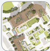
Gascoigne West, Barking