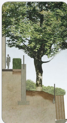
Edith Walk, Great Malvern