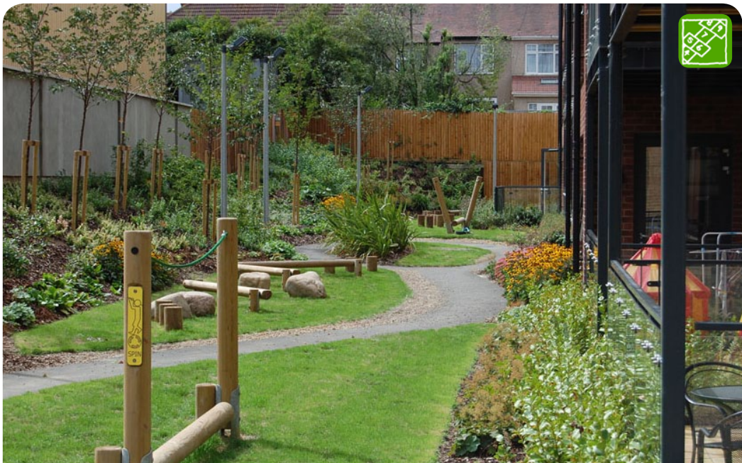
Silver Works, Colindale, Brent Communal garden with linear play area for use by residents and members of the public.