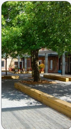
Stanley School, Teddington, Richmond

Green, brown or blue roofs may be used to attenuate surface water run off into the drainage system. This has the added potential benefit of providing valuable rooftop wildlife habitats.