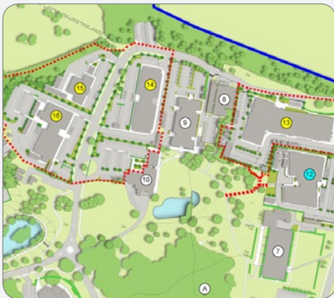
Chesterford Research Park, Little Chesterford, Essex

We have a good understanding of the BREEAM and Biodiversity Net Gain (BNG) process. We are able to advise our clients on where relevant BREEAM credits are likely to be available. We can advise how existing trees might be retained or planting plans be amended to achieve the required BNG of 10 percent.